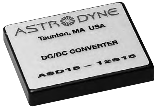
Unit measures 1.6"W x 2"L x 0.375"H