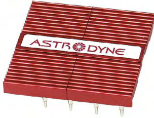
Unit measures 1.5"W x 2"L x 0.45"H