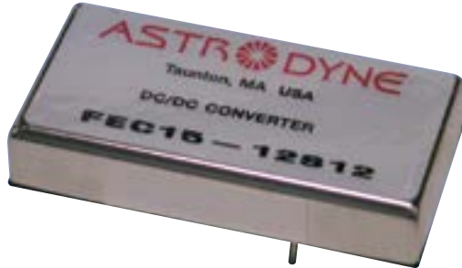
Unit measures 1"W x 2"L x 0.375"H