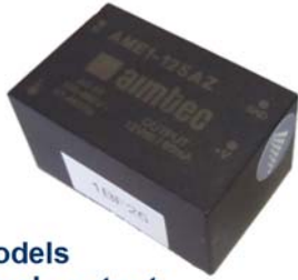
Models Single output